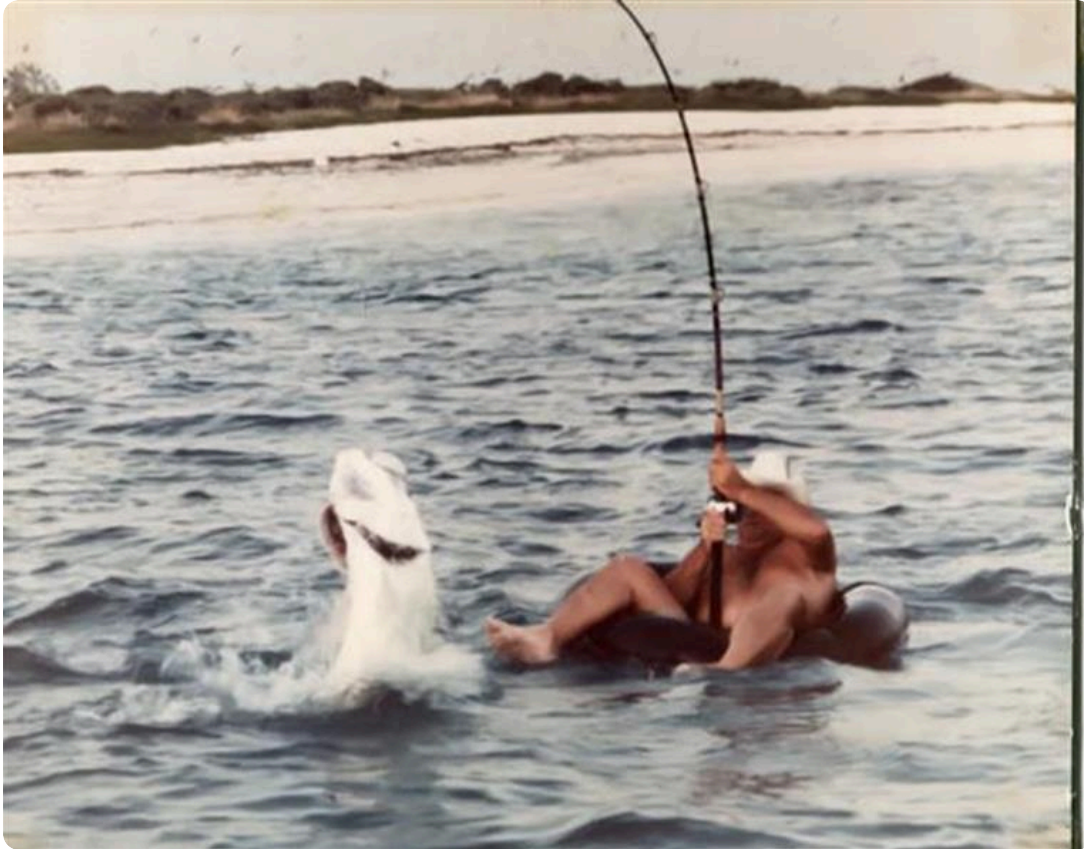
Who needs a boat to catch tarpon...